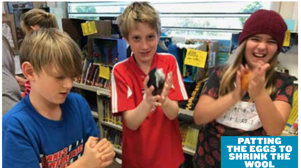
PATting THE EGGS TO SHRINK THE WOOL