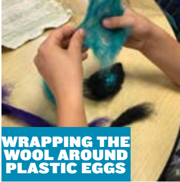
WRAPPING THE WOOL AROUND PLASTIC EGGS