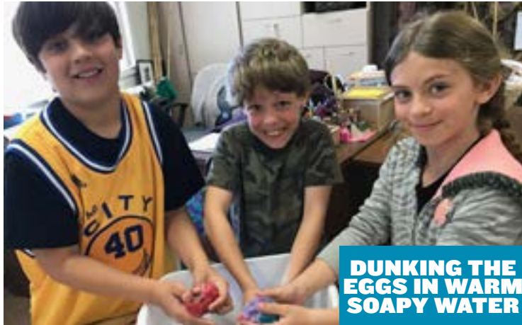
DUNKING THE EGGS IN WARM SOAPY WATER