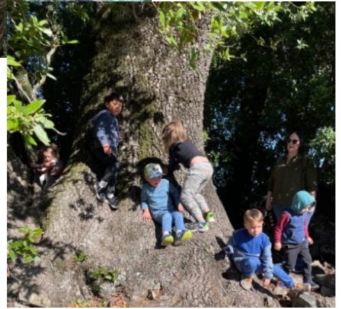
And we had a quick lunch before we headed back to school!