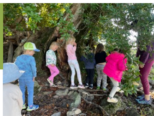
We found a geocache in Umbrella Tree