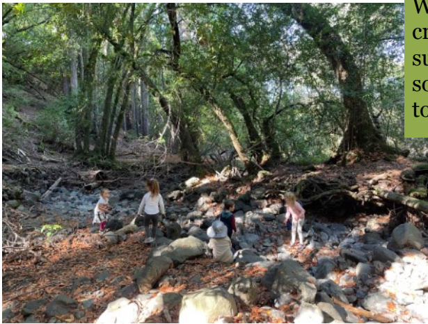
We played in the creek bed, that surprisingly had some water in it for tossing in rocks.