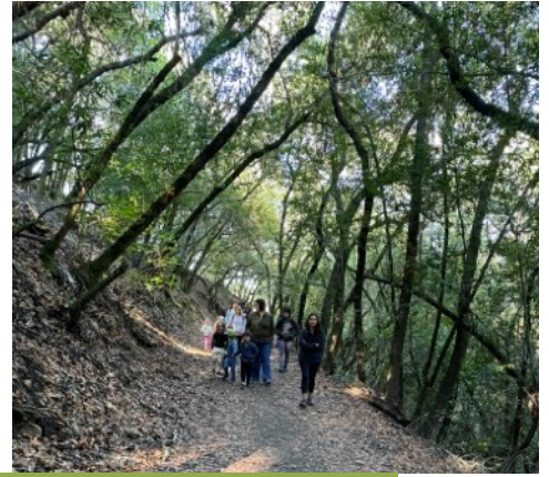
We hiked up a big hill, stopping for a granola bar break