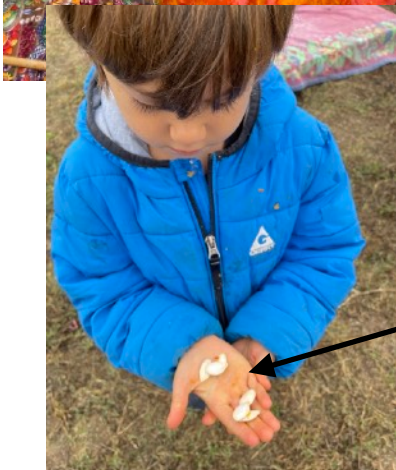
Big bright white pumpkin seeds!

And, before our Jack-O-Lanterns turn to mush, we hammered into those too!