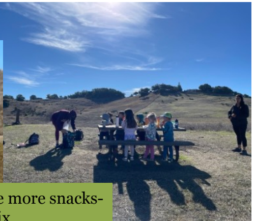
At the top we had some more snacks- our homemade trail mix