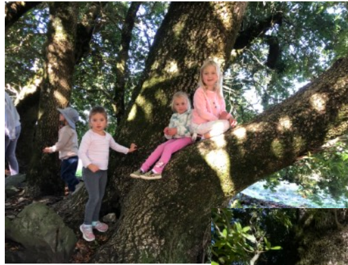
We climbed Umbrella Tree and played in her branches