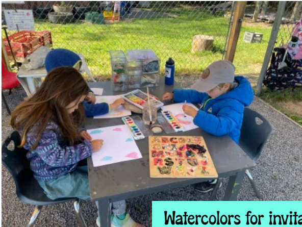
Watercolors for invitations and for gifts