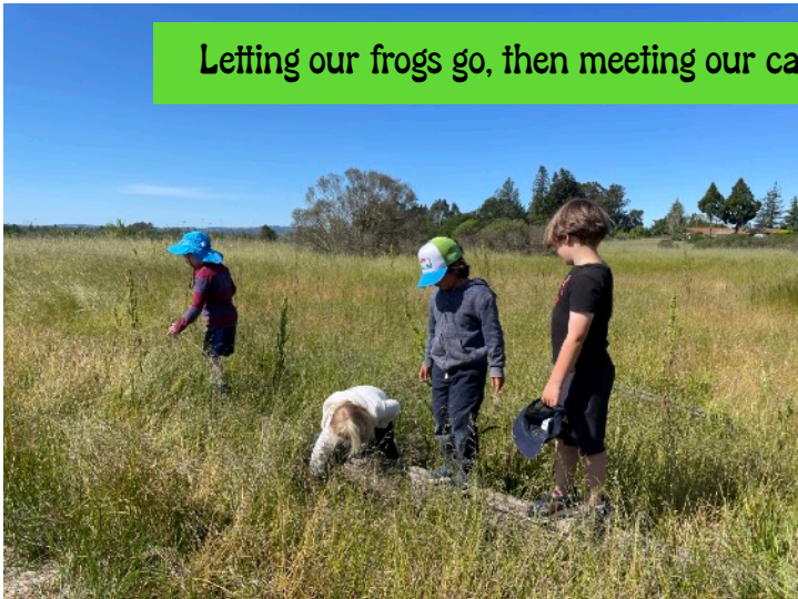
Letting our frogs go, then meeting our caterpillars and ladybug larva!