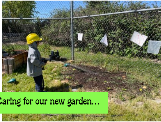
Caring for our new garden...