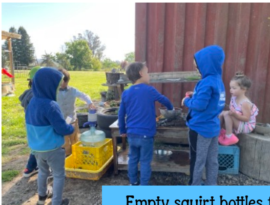
Empty squirt bottles for some new play inspirations

Acorns have been quite busy the last couple of weeks! Creatures, water, cardboard, watercolor, oh my!