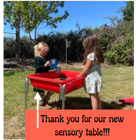
Thank you for our new sensory table!!!