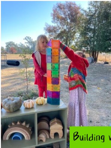
Building with others- peers and buddies!