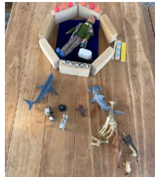
Next, the Sprouts have been taking turns dressing Traction Man (he loves clothes), choosing the supporting characters and telling us a story. Pretty soon it will be the Seeds' turn! And as we begin to finish this study, we are meeting with our buddies to have each student create their own book. So stay tuned!