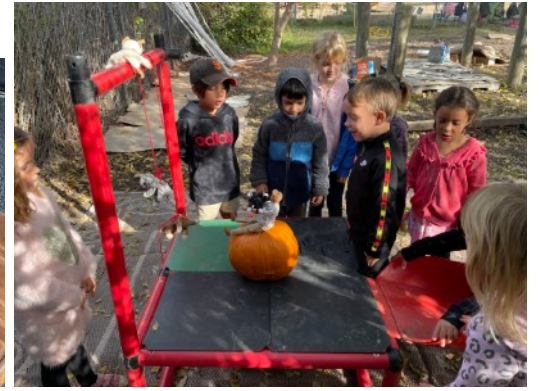
The many adventures of Traction Man and Scrubbing Brush... each week Traction Man has a new adventure.