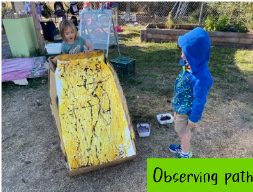
Observing pathways and placement for successful rolling

One of the best parts about being outdoors is how easy it is to explore science concepts. From art to building, games and experiments, so much can be learned through play!