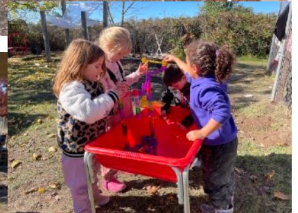
The children have been very interested in ramps- they've explored rolling and launching. Children have begun to understand how to increase accuracy and speed through continuous trial and error.