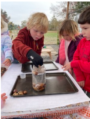
'Tis the season of ACORNS! We experimented with sinking and floating- a sinking acorn is healthy for growing! Children made predictions and compared them to their observations.